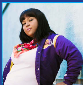
JB The FirstLady